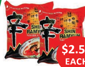
Kimchi Ramen Noodles 120g