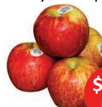
Royal Gala Apples