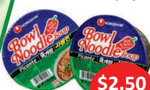
Shim Bowl Hot Spicy 86g