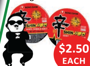
Nong Shim Noodles 86g