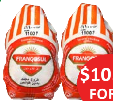
Doux Chicken #11