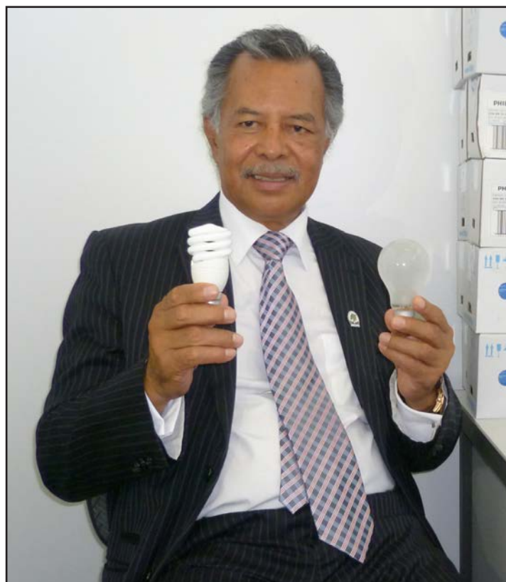
Prime Minister Henry Puna holds an old incandescent light bulb in one hand and the new CFL light bulb in the other hand. He would like you to use CFLs to save money and energy

In the United States the U.S Environment Protection Agency recommends the use of CFLs when compared to incandescent lights for the following reasons. They produce the same amount of light but CFLs use significantly less energy -- 75 percent less energy than incandescent light bulbs and last 10 times longer. CFLs produce about 70% less heat than standard