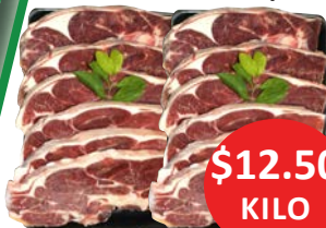
NZ Lamb Chops