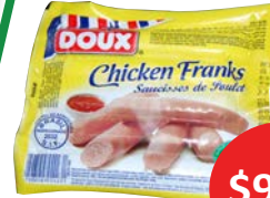
Doux Chicken Franks