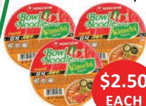
Shim Bowl Noodle Soup 86g