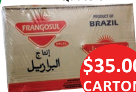
10KG Chicken Leg Quaters