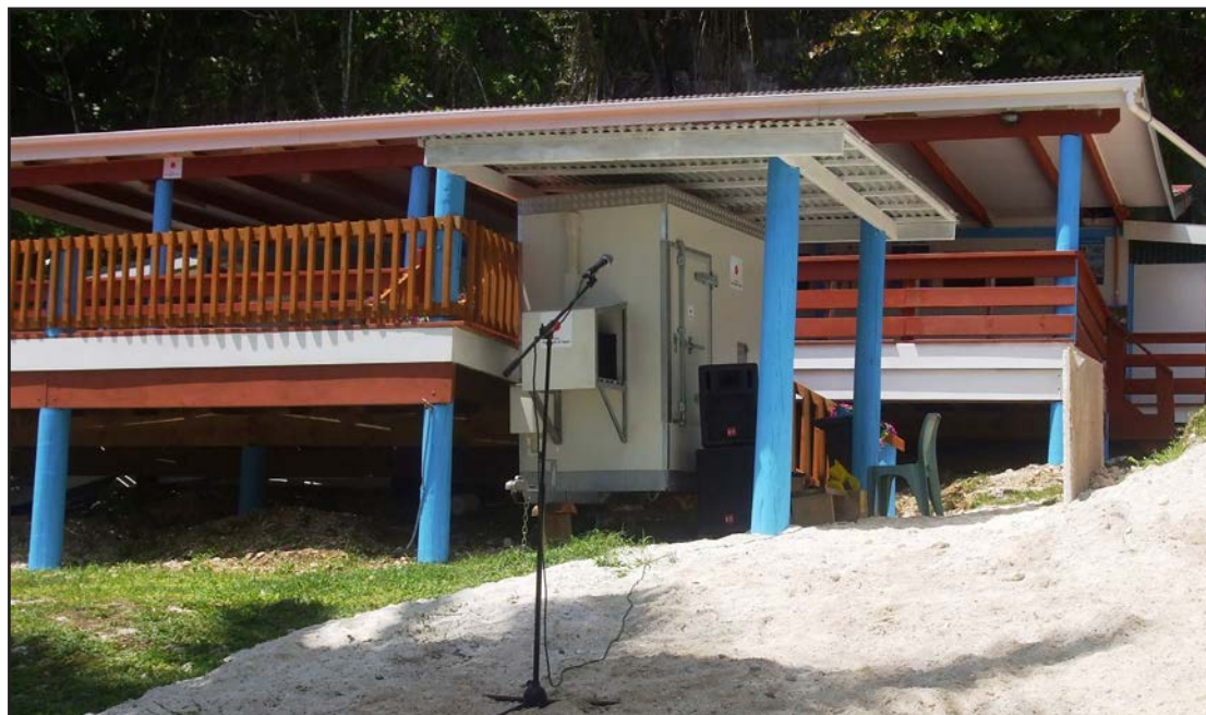
The Mangaia Islands Fishing Association refurbishment

S aturday 16th March 2013- The Mangaia Islands Fishing Association (MIFA) celebrated the completion of a grant funding of $154,000 dollars provided by the Government of Japan under the Grass Roots and Human Security grant.