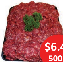
100% Beef Mince